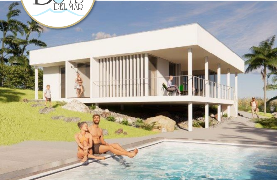
Your home and garden will be the perfect space for all the family to relax in