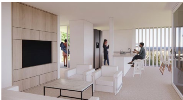
Light and views of nature in the welcoming living area