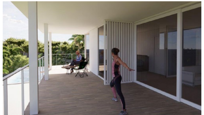
A terrace perfect to unwind on and soak in ocean and garden views

Beautiful optional house designs for both one and two floor properties are available for lots at Hermosa Bay.