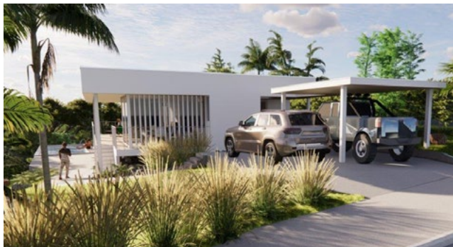
You'll find comfort, convenience and quality