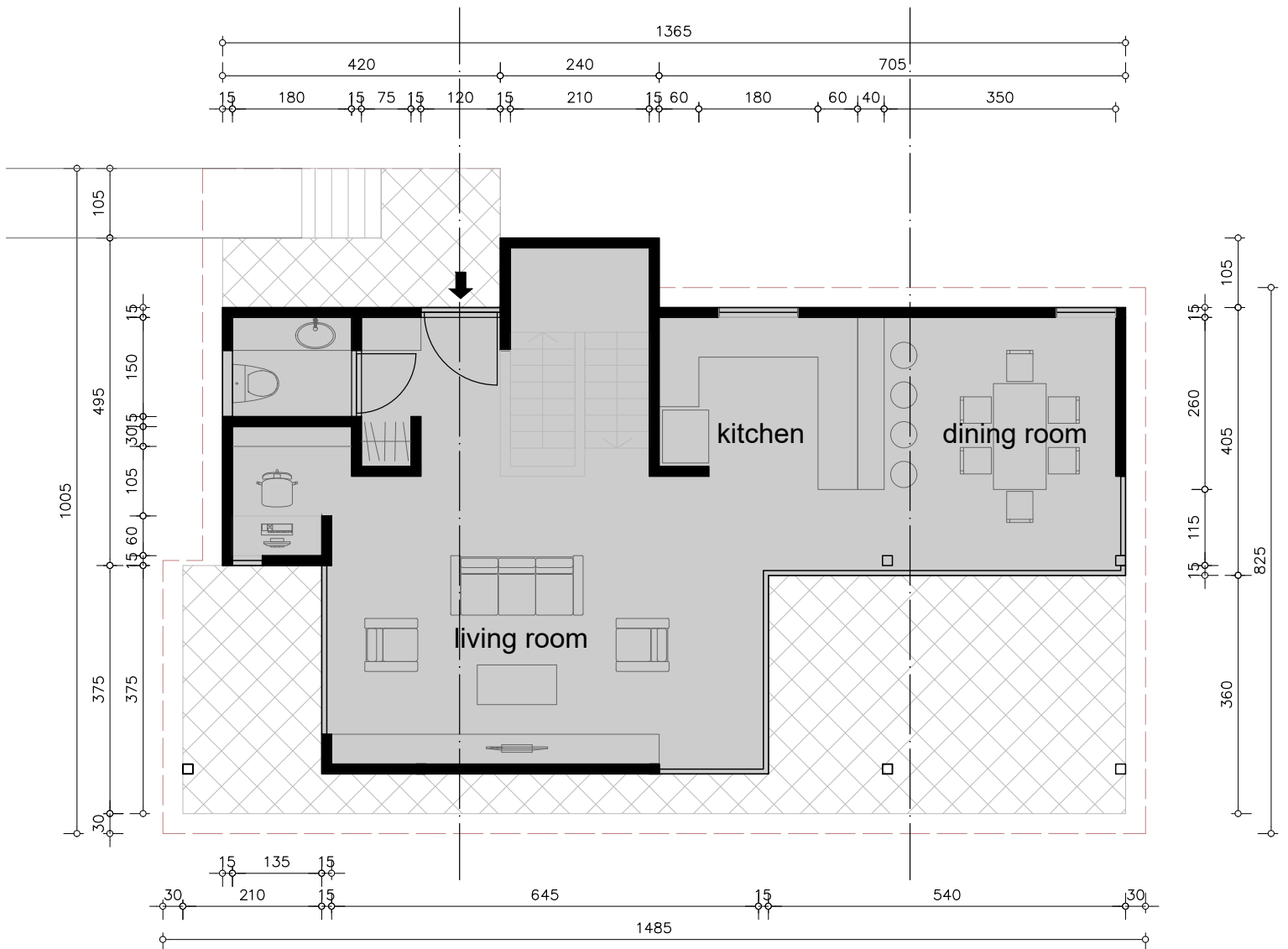
Line dimensions shown in centimeters