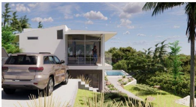
We've thought of everything to help you live your dream