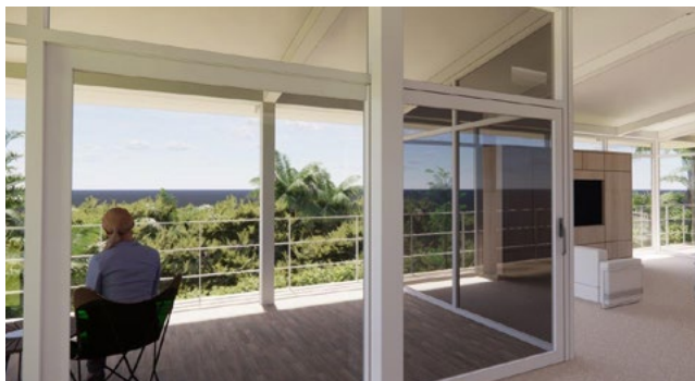
Space to relax and connect with the real you while enjoying ocean and natural views