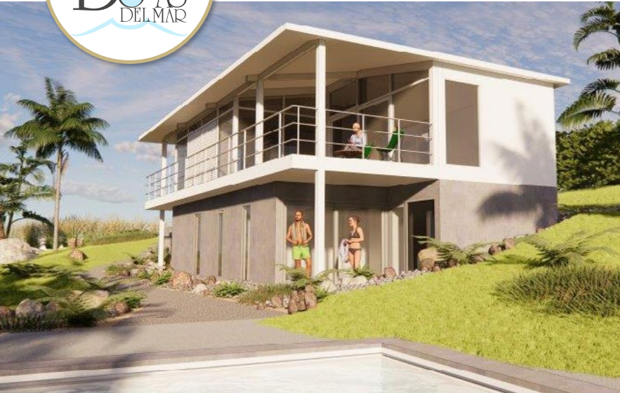
Where beautiful contemporary living meets the majesty of nature